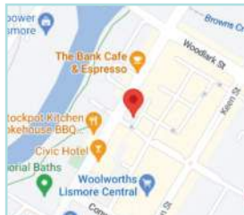
Lismore 46 Magellan Street Next to Lismore Regional Gallery