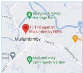
Mullumbimby 15 Tincogan Street. Behind the Mullumbimby and District Neighbourhood Centre