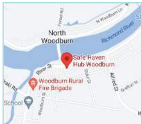
Woodburn Visitors Information Centre 114 River Street