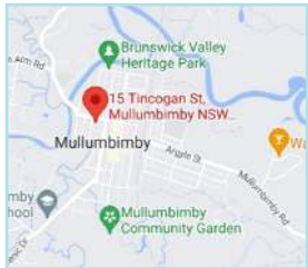
Mullumbimby 15 Tincogan Street. Behind the Mullumbimby and District Neighbourhood Centre