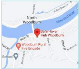
Woodburn Visitors Information Centre 114 River Street