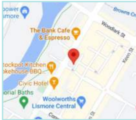
Lismore 46 Magellan Street Next to Lismore Regional Gallery